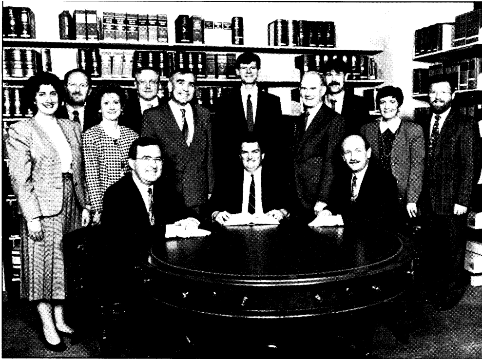
The Public Accounts Committee and secretariat